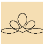
Loops da Loop